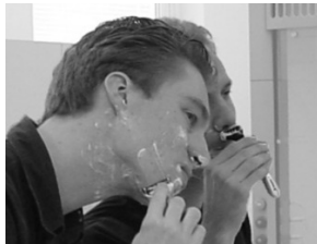
Figure 5. Hands-on experience during a conceptual design workshop.

Both in theory modules and in the assignments these ODD-elements are integrated; training is provided in project cases and applicable design methods in the full design-matrix: industrial/mechanical and consolidating/innovative and secondary context factors are mixed in.