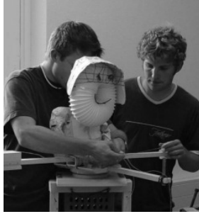
Figure 4. The design workshop: working at a lady robot

The modification of teaching and assessment methods- towards intensive workshops, inter-teaching project teams, assignment-driven learning, design-review presentations - was also needed because of the diversity of background of the students.