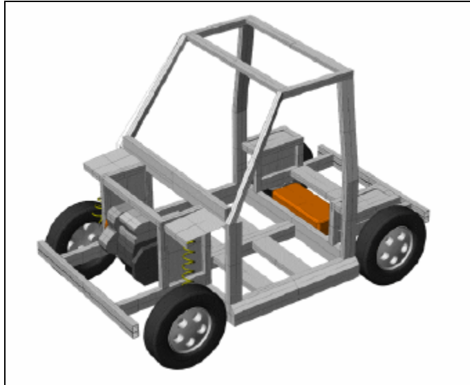
Figure 3. Optimal solution of the space-frame