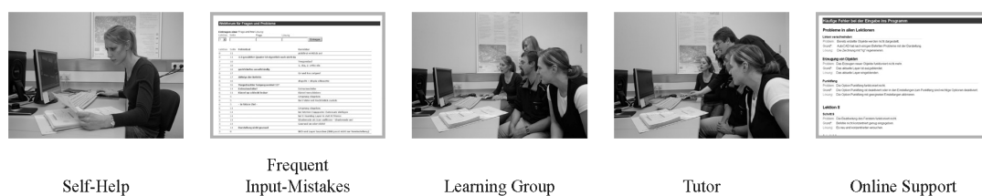
Figure 4. Types of support

Based on the instruction various categories of issues can be differentiated: careless mistakes during input, individual difficulties in comprehending certain steps of construction, problems caused by accidentally changed program settings or issues independent from the construction method. Hence, it is also necessary to develop adequate support services tailored to individual requirements. These are provided during in-class presentation by partners and tutors, during E-learning and for self-help through the different instructions as well as various online offers.