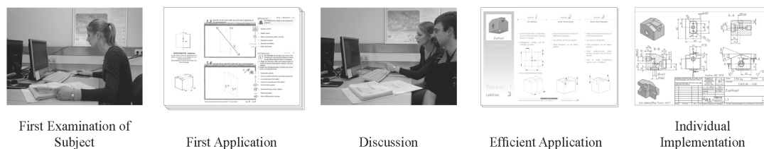
Figure 3. Types of application

As individual weaknesses and strengths are supposed to be balanced out among the participants, another important component of the process is to form learning groups of four participants each where problems and questions arising during the application can quickly be solved [3]. Mutual explanations accelerate and deepen the learning process, lead to an extensive independence from support services and develop the students' soft skills. Exercises consisting of single components which are solved by one participant each and finally joined to an assembly strengthen the cohesion of the group even more. This bidirectional support can only to some extent be realized in the context of E-learning e.g. by providing chat rooms.