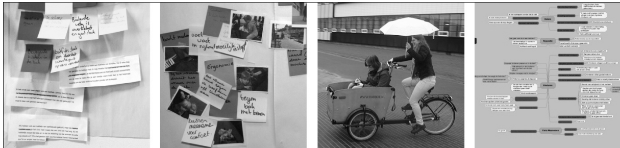
Figure 4. Adding quotes (a) and pictures (b) of 'online stories' to the frame of reference, role-play with the carrier bike (c) and part of a mind map of the frame of reference (d)

Four groups of five students participated in the course. The Envisioning Use workshop was taught by executing the workshop with students on a fictional case (a compact camera, see figure 3). They then had to apply it to the carrier bike. An important difference between the fictive case and this case is students did have experience with the compact camera, but did not have personal experience with carrier bikes. Therefore they needed other input for the workshop. They were encouraged to gather stories of use of carrier bikes online before the workshop.