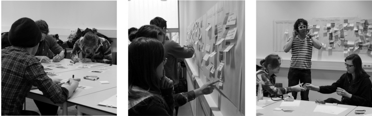
Figure 3. Remembering and imagining (a), targeting (b) and envisioning (c) in practicing the Envisioning Use workshop in the course.

The workshop was developed in collaboration with designers in practice in multiple iterations of execution and evaluation. The reactions of participants were generally very positive. However, until now we could not evaluate the impact of the workshop on a complete design process. The work of students in the course ‘design for dynamic use’ will be used to achieve this goal. An additional research objective is to explore the format of the frame of reference to take into the design process.