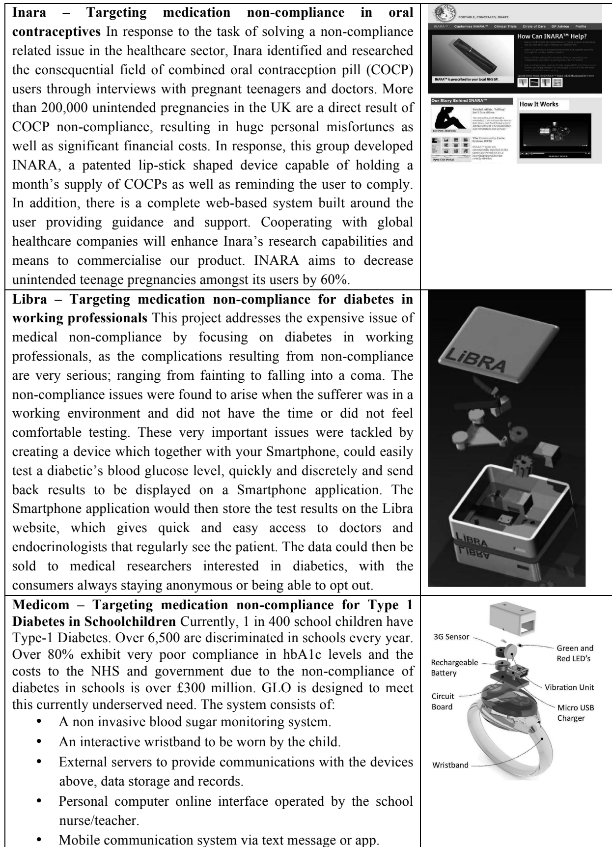
Table 1. Examples of student work

provided to demonstrate the scope and nature of the problems identified and the solutions proposed in response to a brief on Medication Non-Compliance. The course narrative is illustrated in Figure 1.