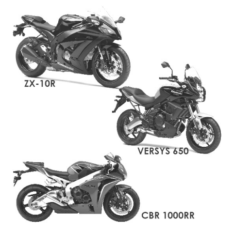
Figure 2. Sample of models of superbike for a case study

Each of the elements as stated above are very important to consider in order to produce a good design to elicit user attraction. Subsequently, the thing that we have to understand is, what are the relationships among the design form, function and the emotion. For the simple explanation, this paper will provide an example as case study; it is three (3) models of superbike, Kawasaki Ninja ZX-10-R, Kawasaki Versys 650, and Honda CBR1000RR (Honda Rabbit).