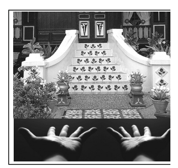
Figure 6. Scuplture