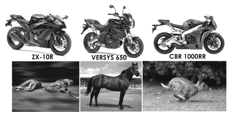
Figure 3. The pair comparison of selected model image

There are three models of superbike selected as a simple analysis for the study. As we can see the figure 2 given above, the design of the superbike is not only for the aesthetic, but also following and considering its main purpose, for riding. Before starting the process of the design, the function is the main focus for the design team, involving mechanism, system, engineering, technology and any related compulsory element. In this study case, the function of this bike is to speed on the road, faster than an ordinary motorcycle. So, they related the function element of this bike with the overall design or outlook. As example, ZX-10R has been designed for very high performance with speeding over 300km/h, with 175 hp, to compliment the engine's prodigious power production, suitable for racing. From this function, the outcome of the design is compact, narrow and lightweight, aerodynamic, lowered and extreme. So, the character that is most suitable with all these criteria are adapted from closest image, such as cheetah, one of the fastest animals on the planet. It has a good similarity character with this motorbike image, the muscle, running style, body cutting, chasing head, and the tail. As the result, the users will imagine this entire character image in this motorbike design and influence them to own and try this for their satisfaction. The chart below shows the pair comparison of selected model image (see Figure 3).