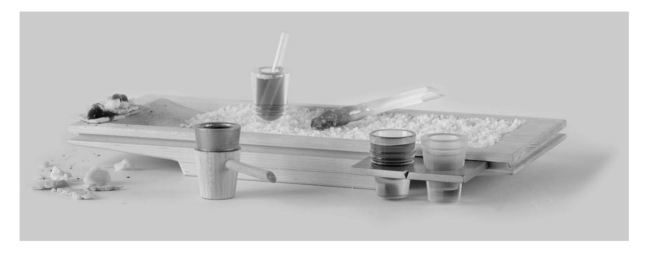
Figure 2. Maple syrup tasking dish set, inspired by traditional tools, M. Leclerc-McGuire (2015)

At strategic moments, students were asked to seek feedback from colleagues and both collaborating parties (academic and professional). In a logbook, students kept track of ideas, comments, critiques and progress. On a weekly basis they received comments. All were instructed to provide their opinion by pointing out the strong and weak aspects of the work, and to suggest how to improve the design. The teaching partners were constantly in touch to discuss students' progress and strategize on how to address weaknesses and boost individual performance. This occasionally led to adjustments of schedule and scope (flexibility, creative chaos), offering individual consultations, injecting theoretical notions and demonstrations on how to improve certain skills.