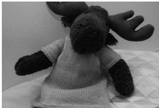
Figure 3. 'Elgar'

I offer a personal example of how to tell a story through the product, so the object keeps the interest of the user and gets them to care about it.