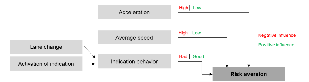
Figure 2. Example for the translation of demanded information for usage data support