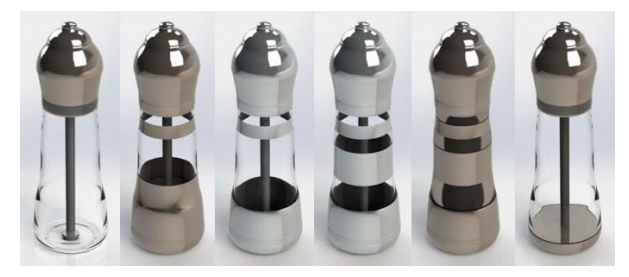
Figure 6. Based on the geons of the prototypical PM shape, metallic and transparent materials were applied to some of the geons