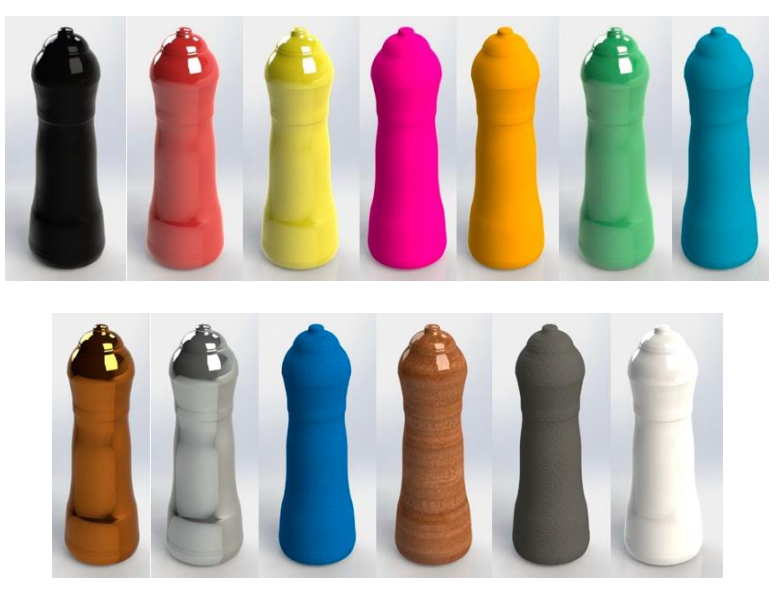
Figure 5. Up row: Mate and bright colours were applied. Down row, 14 Procedural Materials were applied. The metallic materials, plastics and woods seemed to be more adapted to the 3D form. From left to right: bronze, chrome, blue fabric, chestnut, rubber and ceramics

but not of wood). In Figure 6, materials were assigned to some of the geons, trying to not to be in conflict with functional characteristics of the PMs, for instance, the PM body is transparent to allow the user to check the amount of pepper stored in the PM.