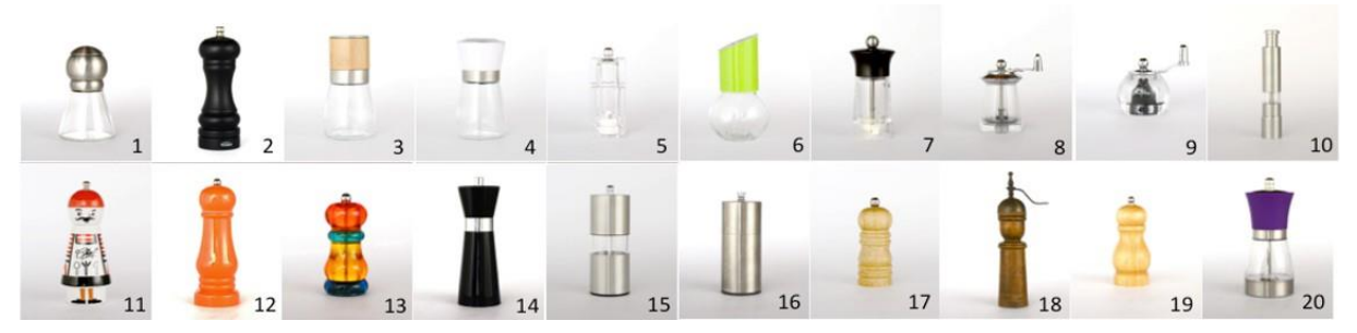
Figure 3. The set of 20 commercial PMs used as stimuli ranging from low formal complexity (for example, PM 16) to high formal complexity (PM 18)

20 different commercial PMs were used as stimuli with different formal complexity among them: amount and variety of geons, number of colours, materials, and symmetry, Figure 3. Geons are basic perceptual forms present in the human perception of forms, and suitable to decompose artefacts in their parts (Biederman, 1987).